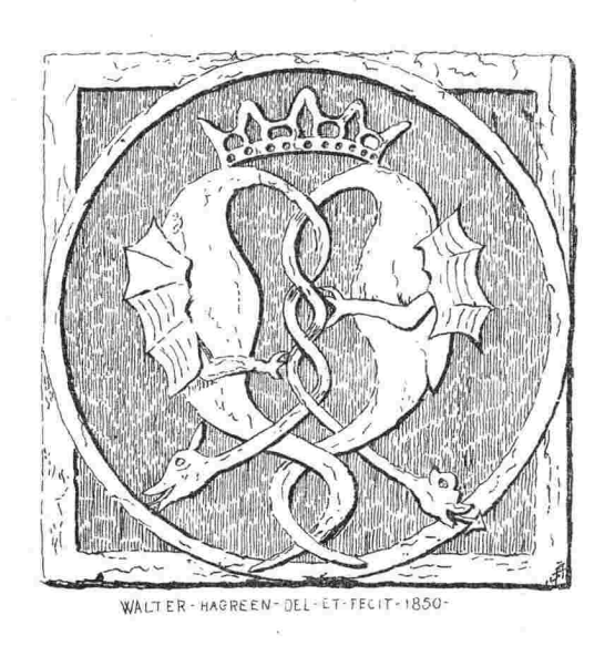
Panel and Munogram, Ixworth Church, Suffalk.